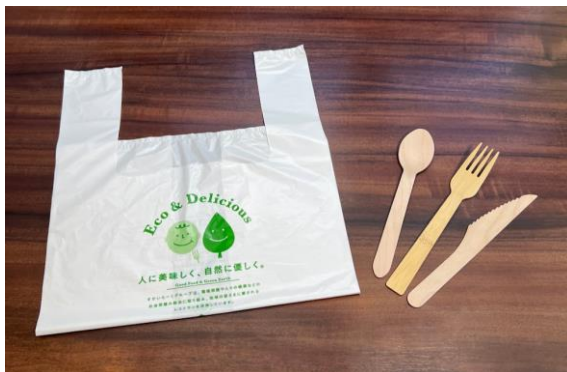
(From Left) Shopping bag, wooden spoon, bamboo fork, and wooden knife

Additionally, take-out and delivery forks will be changed from wooden to bamboo in phases at approximately 2,700 Skylark Group stores, as a measure to improve the durability of single-use forks.