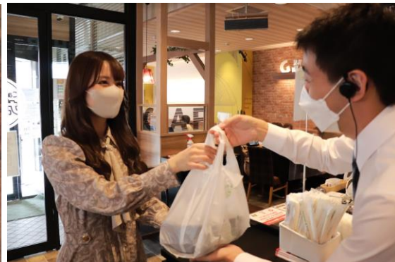
Take-out ordering (image)